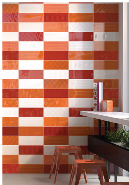
Milano Red, Orange and White