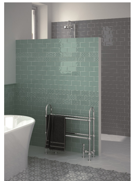
Brick Jade and Gris Oscuro (Dark Grey)