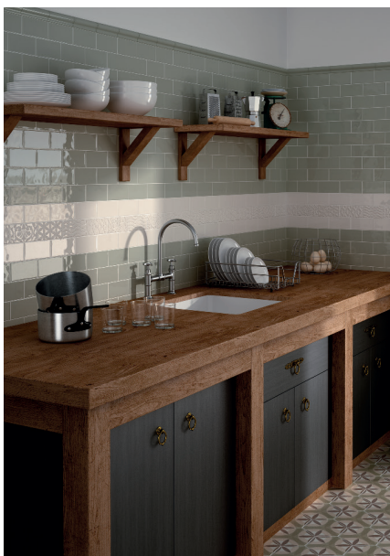
Brick Olive and Blanco

If you're looking for a truly customised look without the accompanying price tag, then be a bit creative by choosing two different colours of the same tile and create a feature strip. There really are no limits as to how creative you can be with Metro tiles. For a really bold statement, then choose three or four colours and place them randomly in the space.