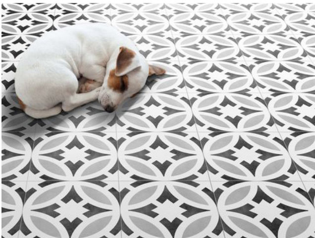
New England Mono Star Decor

From striking monochrome to soft, pastel tones, here's our guide to help you find a style to suit you and your home. The diversity of styles available means that whatever the style of home or room, there is a perfect patterned tile to suit it.