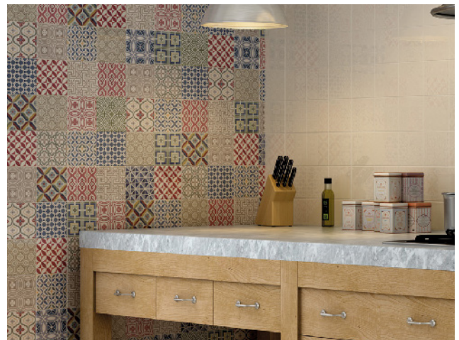
Quilt Patchwork Random Decor and Ivory