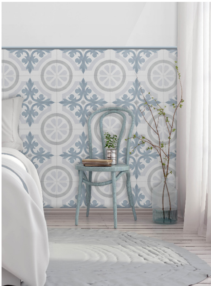
New England Pastels Gloucester

Patterned tiles can take your washroom to wow. You can really go to town with the monochrome beauties in the New England range. Or for a softer pastel look, the Bordeaux Toulon patterned tile looks beautiful, as shown in this bathroom, especially with the Victorian-style radiator and taps. And the Bordeaux Bianco Paris patterned tile creates a style feature out of this shower cubicle. Even a stairway can be brought to life with the use of some Quilt Patchwork Random Décor tiles.