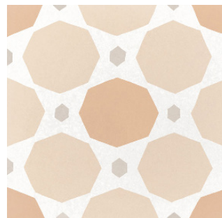
Art Pastel Topaz