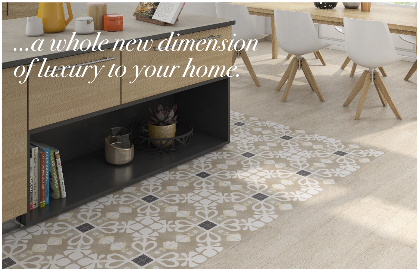
Bordeaux Grenoble Patterned