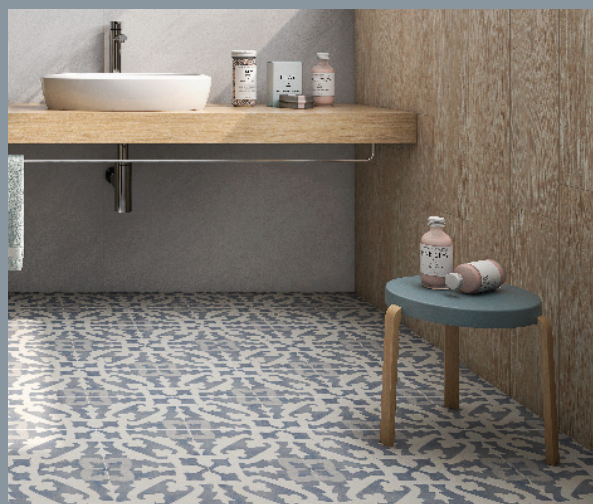
Bordeaux Toulon Patterned

Patterned tiles can take your washroom to wow. You can really go to town with the monochrome beauties in the New England range. Or for a softer pastel look, the Bordeaux Toulon patterned tile looks beautiful, as shown in this bathroom, especially with the Victorian-style radiator and taps. And the Bordeaux Bianco Paris patterned tile creates a style feature out of this shower cubicle. Even a stairway can be brought to life with the use of some Quilt Patchwork Random Décor tiles.