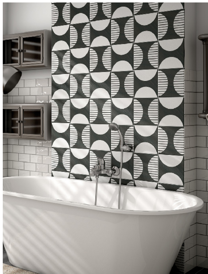
Art Black and White Moonline