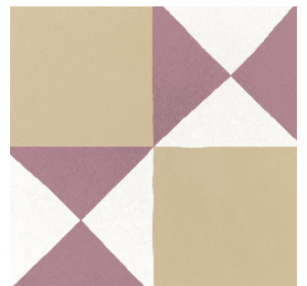
Art Colours Chess

Patterned walls and floors need not be restricted to Victorian or Edwardian homes. A modern home or a plain space works just as well with patterned tiles. A small room will work better with a more intricate pattern, while a larger pattern will hold its own and make more of a statement in a sizable room without feeling too overbearing. Spacious hallways are perfect for being exuberant with a large patterned floor tile, impressing visitors as soon as they walk through the door.