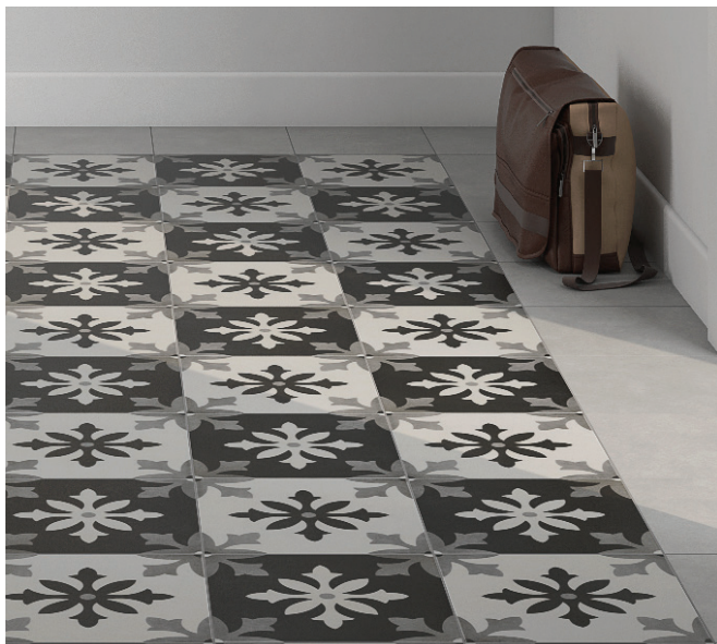
Bordeaux Paris Nero Patterned

Use bold pattern on the floor to create a real statement and transform a room, or use a soft, pastel pattern on a bedroom wall for a unique, European look.