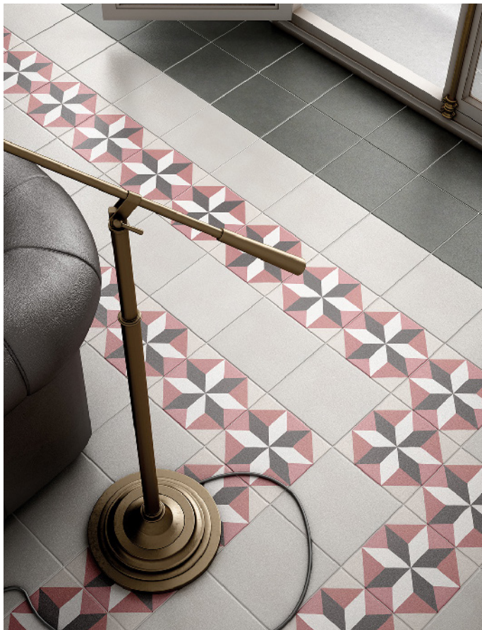
Art Colours Magic