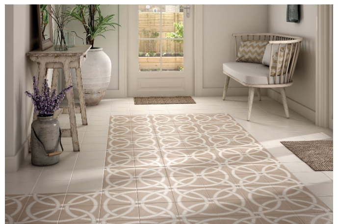
Art Pastel Loop

Patterned walls and floors need not be restricted to Victorian or Edwardian homes. A modern home or a plain space works just as well with patterned tiles. A small room will work better with a more intricate pattern, while a larger pattern will hold its own and make more of a statement in a sizable room without feeling too overbearing. Spacious hallways are perfect for being exuberant with a large patterned floor tile, impressing visitors as soon as they walk through the door.