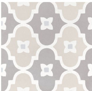
Art Pastel Bowtie