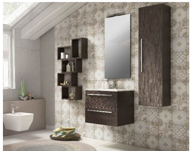
Artisan Tortora Beige