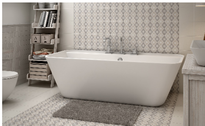
Art Pastel Bowtie